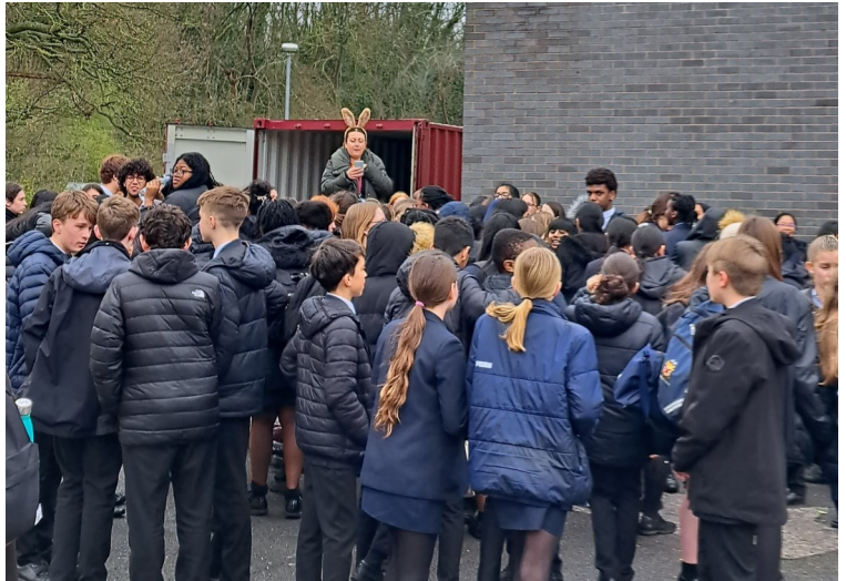
Getting ready to head out on the Easter Egg Hunt!