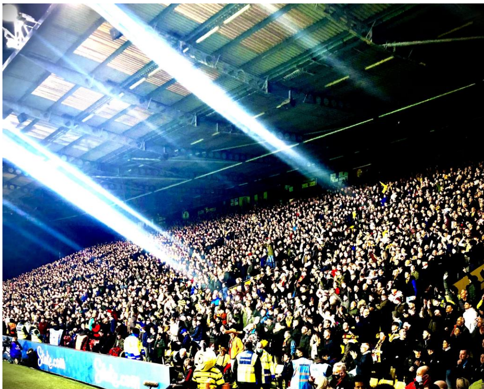
Ollie Arnold 11AKY

The Art & Photography department ran our annual photography competition and this year's theme was 'support'. The competition was open to all students across all year groups, regardless of their subject choices. They could interpret the word 'support' however they liked, as long as the image included a clear link, an interesting composition, and was aesthetically pleasing. We had four winners this year who received a portable photographic studio as a prize.