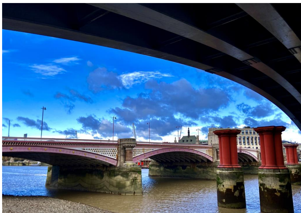
Erno Thorp 8CMO