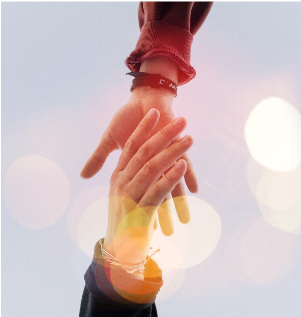
Prabhuv Gautam 9KPO